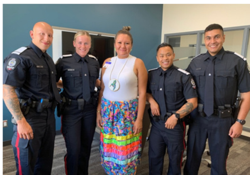
Community members partake in community conversations as part of recruit training- 2025