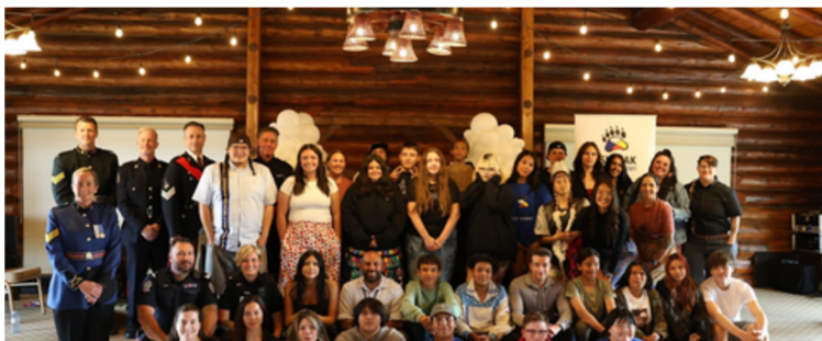
Oskayak Police Academy in 2025