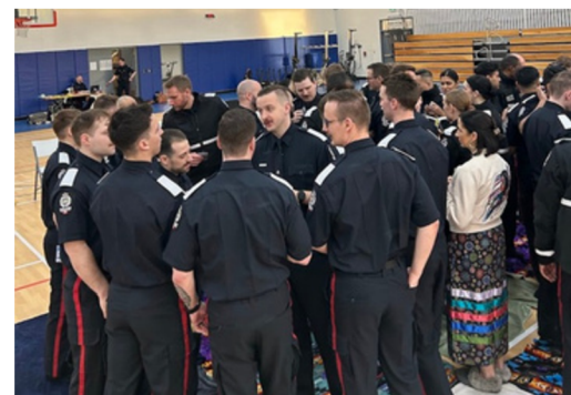
Edmonton Police Recruit Class - Blanket Exercise- 2025