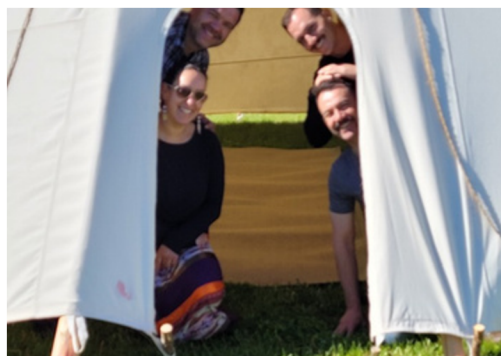
EPS New Hires Participating in Cultural Camp Bent Arrow 2025