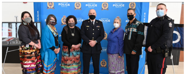
Smudging Ceremony for new Northwest Campus Facility- 2019